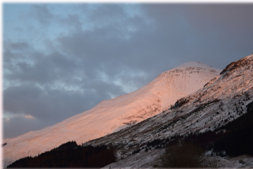
Ben More evening

At least 10 people were booked to arrive from Friday at the Ochils MC hut and other venues in Crianlarich, but by Monday the long forecast Beast from the East storms from Siberia were looking increasingly likely to materialise. A few people wisely decided to abandon. On Tuesday I viewed the webcams on the M74 and decided to go up overnight when there would be less traffic to block