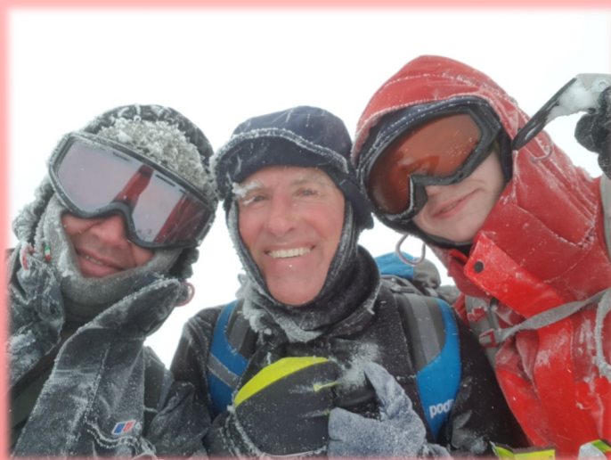
Summit Beinn Ghlas (MC, BS, FP)

The wind and low cloud persisted on Monday. AD, AM and CP employed the Two Car Trick to enable them to take the enjoyable West Highland way to the Tyndrum Tea Shoppe via the endear-