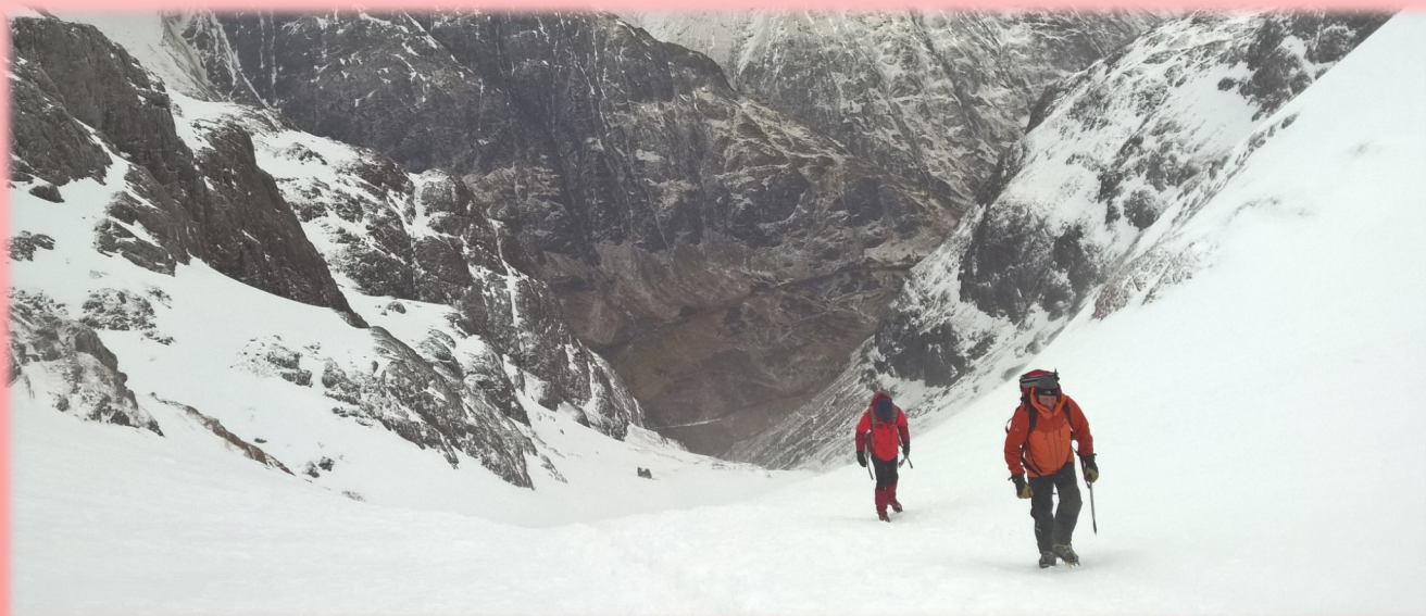
Ascending Stob Coire nan Lochan (FP, AM)