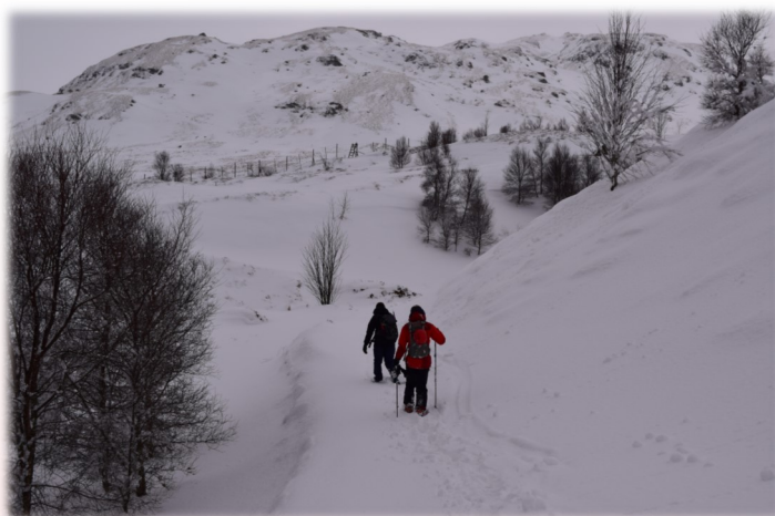
Scenic valley below Ben Lawers (MC, FP)

ing ponies in their shelter, and walk a different way back to the car at the spot used by Ben Lui climbers. MC, FP and BS had hoped for better weather for a first time visit to tourist mecca of Ben Lawers. They were almost thwarted by an unanticipated road closure just outside Killin, but gritted their teeth and added 5 miles each way of roadwalking to the itinerary. The Ben Lawers Visitor Centre is marked as a building on an old map, but proved to be now merely a car park with a couple of