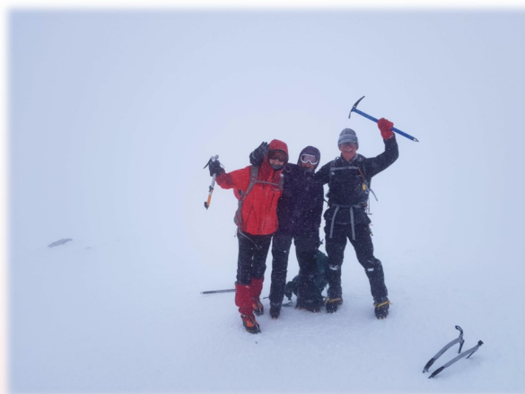
Summit Ben Lui (FP, CP, AD)

The Dewsbury party were not back by 9pm from their intended ascent of Ledge Route on the Ben,