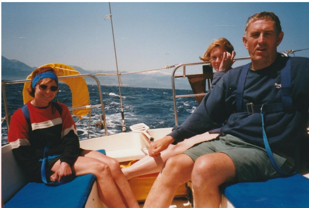
Gulf of Corinth 1999