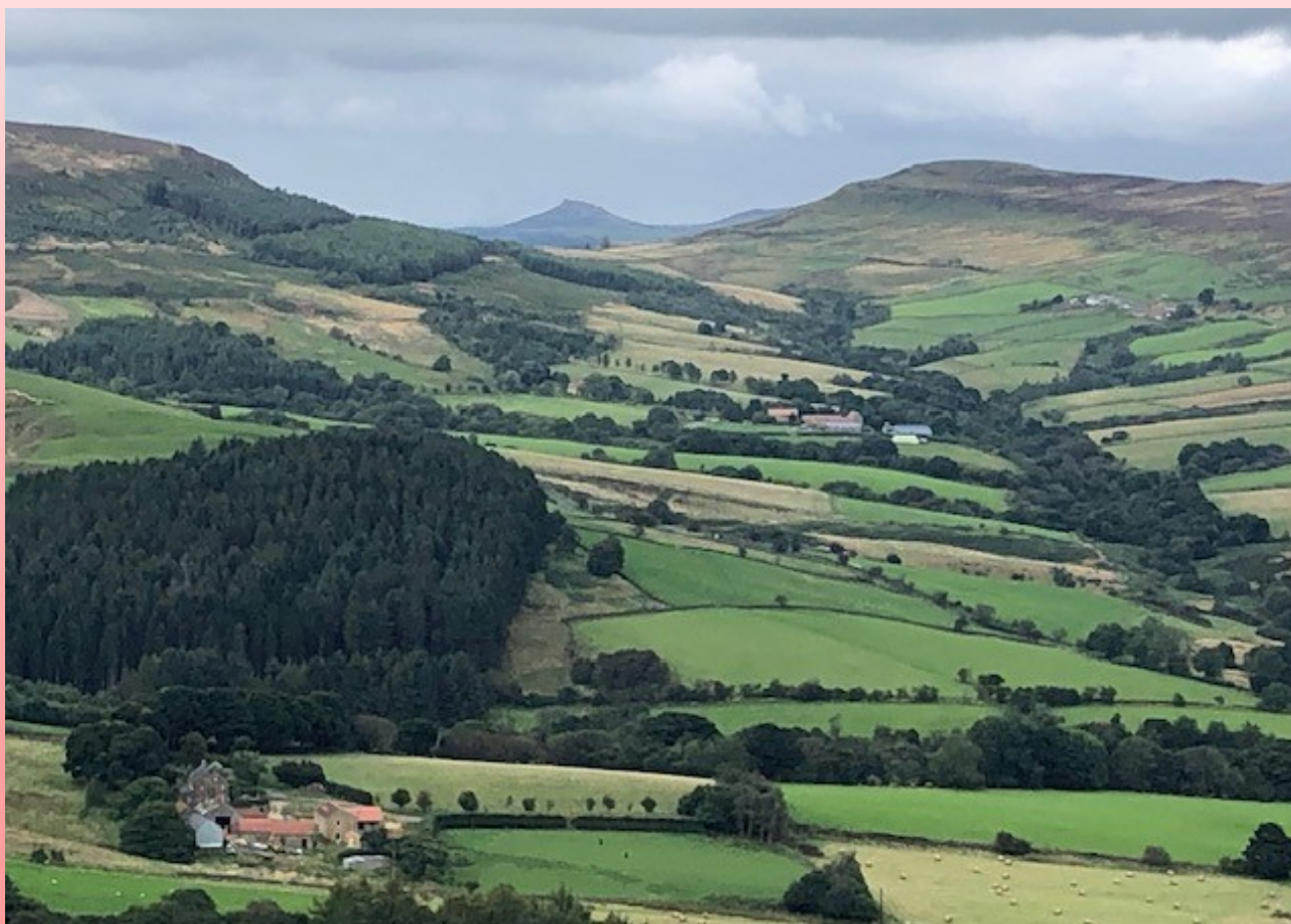
Cringle Moor and Cold Moor, with Rosebury Topping in the distance

After lunch the route continued to follow the Cleveland Way up the steep accent onto Carlton Moor. As the party made their way up onto Carlton Moor it became clear that the bad weather that we had seen approaching from Cringle Moor, was not rain as had been presumed, but a bank of low cloud. The low cloud and mist soon began to swirl around the top of Carlton Moor making it appear higher and wilder than perhaps it really is.