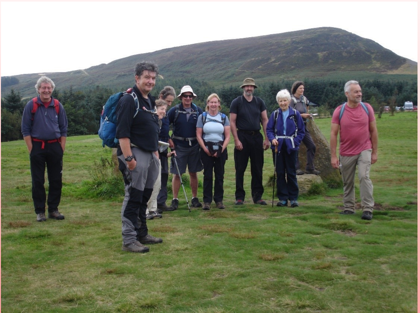
The Group at Lordstones

Most of the party stopped for refreshments at the Buck Inn before heading off home.