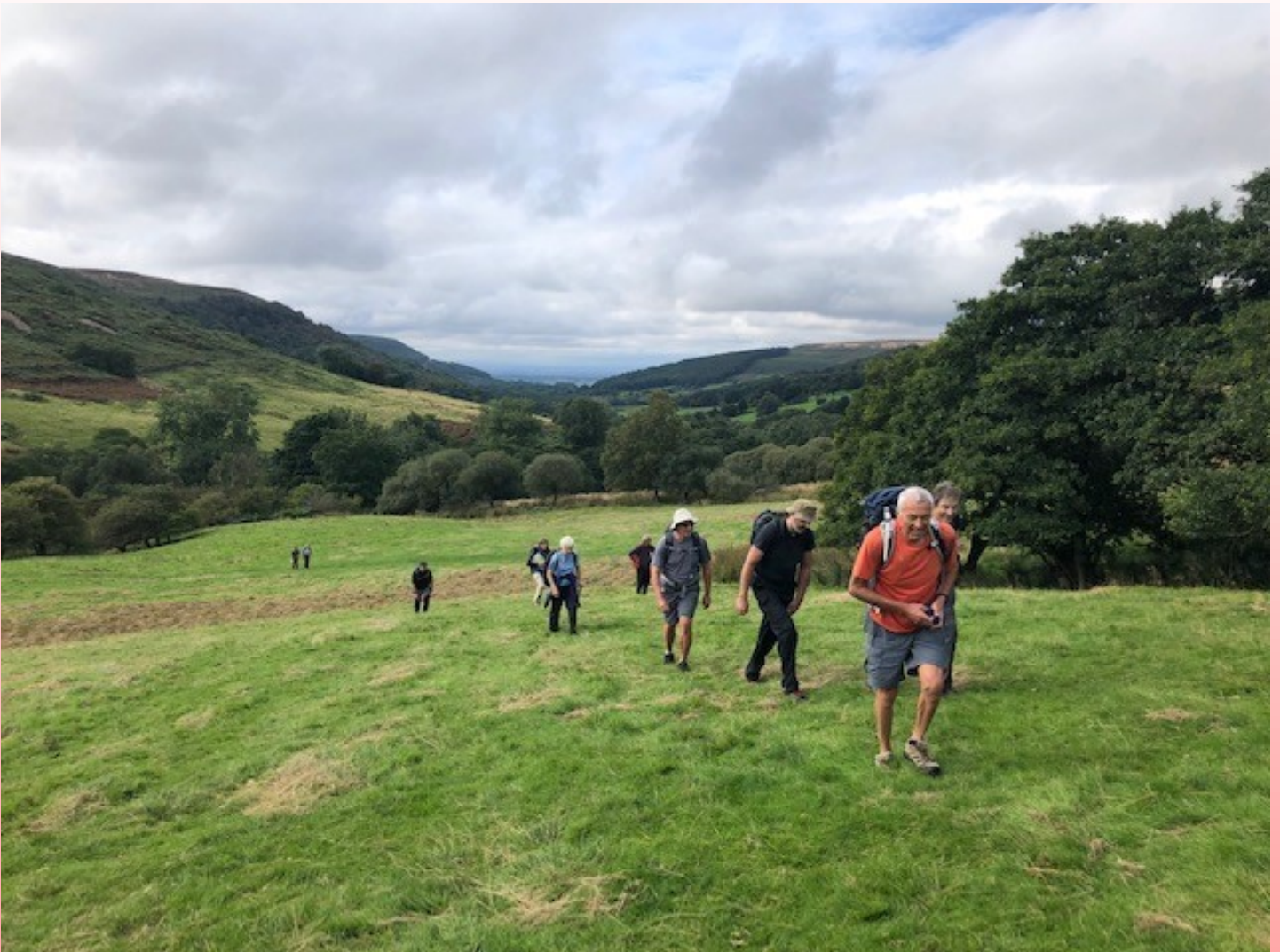
Climbing up towards the head of Scugdale

The plan had been to mainly take footpaths through Scugdale but a recent reconnoitre had revealed that one of the intended footpaths was so overgrown as to be impassable, so a short stretch of road walking was required instead.