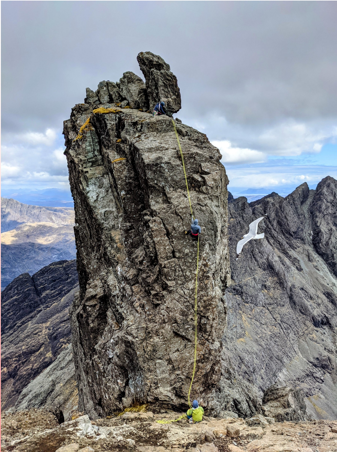
Birdseye View - Best Climbing Photo: Golden Peg winner by Abbie Lawson